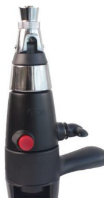
iTap PET for designer handles