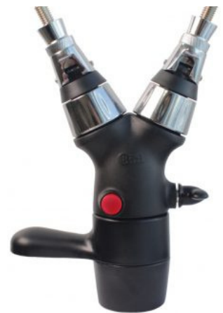
iTap2 PET for designer handles