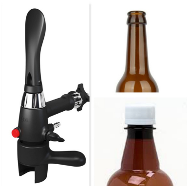
iTap PET & Crown